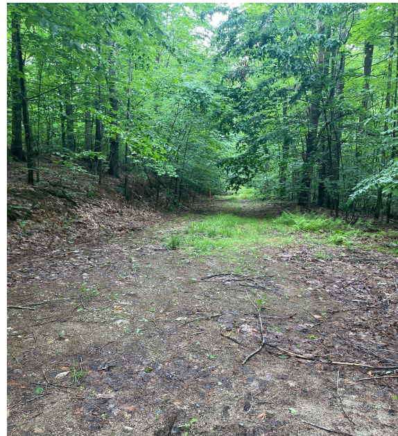
Interior Woods Road